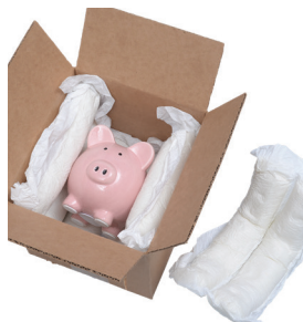
Continuous Foam Tubes